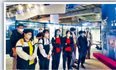
學生認識各種檢測及認證服務。 Students gained knowledge about a variety of testing services.

The Testing, Inspection and Certification (TIC) Industry Training Advisory Committee organised a workshop in Hong Kong Productivity Council on 14th December 2021 for senior secondary school students, enabling them to gain knowledge about the TIC industry and the testing services relevant to our daily life.