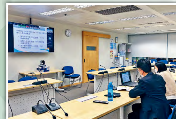
在疫情下，秘書處以網上形式向老師提供資訊。 Under the pandemic, the QF Secretariat provided information to teachers online.

QF Secretariat hosted online seminars for secondary school teachers