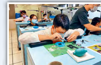
學生一嘗親自製作手錶的樂趣。 Students had fun in the attempts to assemble their own mechanical watches.

The Watch and Clock Industry Training Advisory Committee organised two interactive workshops for secondary school students on 30th October and 13th November 2021. Students gained knowledge about the career prospect of the industry and assembled their own mechanical watches under guidance of experienced practitioners.