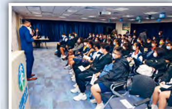
超過 50 名學生參加實體工作坊。 Over 50 students participated in the face-to-face workshop.

The Insurance Industry Training Advisory Committee organised workshops and interactive quizzes on 14th and 16th December 2021 for senior secondary students to learn about the key job posts, progression pathways and latest development of the insurance industry.