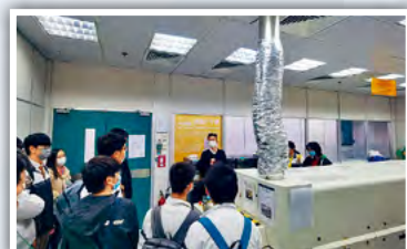
高中生有機會進入實驗室聽從業員解說。 Senior secondary students had the opportunity to walk through the laboratory and learn from the practitioner.