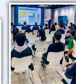
超過 70 名學生參加工作坊。 Over 70 students participated in the workshops.